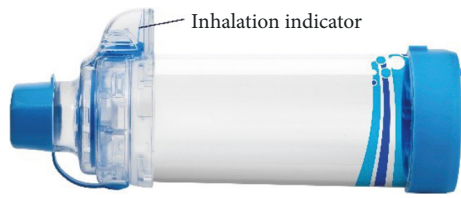
FIGURE 1: Valved holding chamber featuring an inhalation indicator.

In 2009, the European Medicines Agency recognized the significant role of the VHC in drug delivery when they recommended that the development of drug products using a pMDI include testing with at least one named VHC. In addition, they recommended that if a VHC was to be substituted or added, appropriate equivalency data for the alternative VHC must be presented [11].